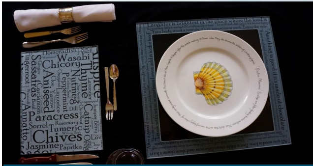
Etch Dining Set

Need some inspiration? Here are some of the previous designs we have printed.