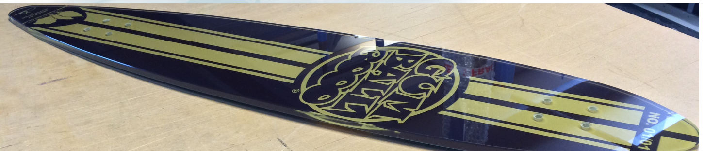
Even Toughened Glass Skateboards....

For more information visit: www.stglass.eu Or contact us with your enquiry: +44 (0) 1603 263130